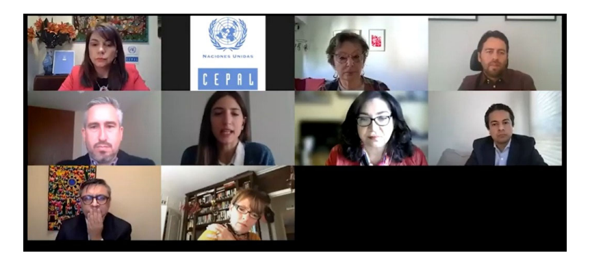
Webinar – Participation of the academic sector in the promotion of inclusive open government policies: lessons learned and challenges in Latin America

In the framework of Open Government Week, which took place from 17–21 May 2021, ECLAC, the Open Parliament e-Network (OPeN) and the regional Open Government Academic Network (RAGA)